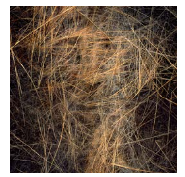
Ion Scott Anderson book of arass #1, 2012 Edition of 7 | Archival Pigment Print Courtesy the Artist and Haw/Contemporary, Kansas City