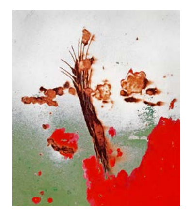
🔺 Dan Frueh Prairie Fire, 2014 | Archival Ink Jet Print