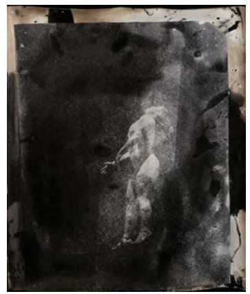
▲ Michael Pointer Fallen , 2012 | Gelatin Silver Monotype Print